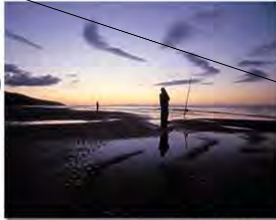
Fishing at sunset